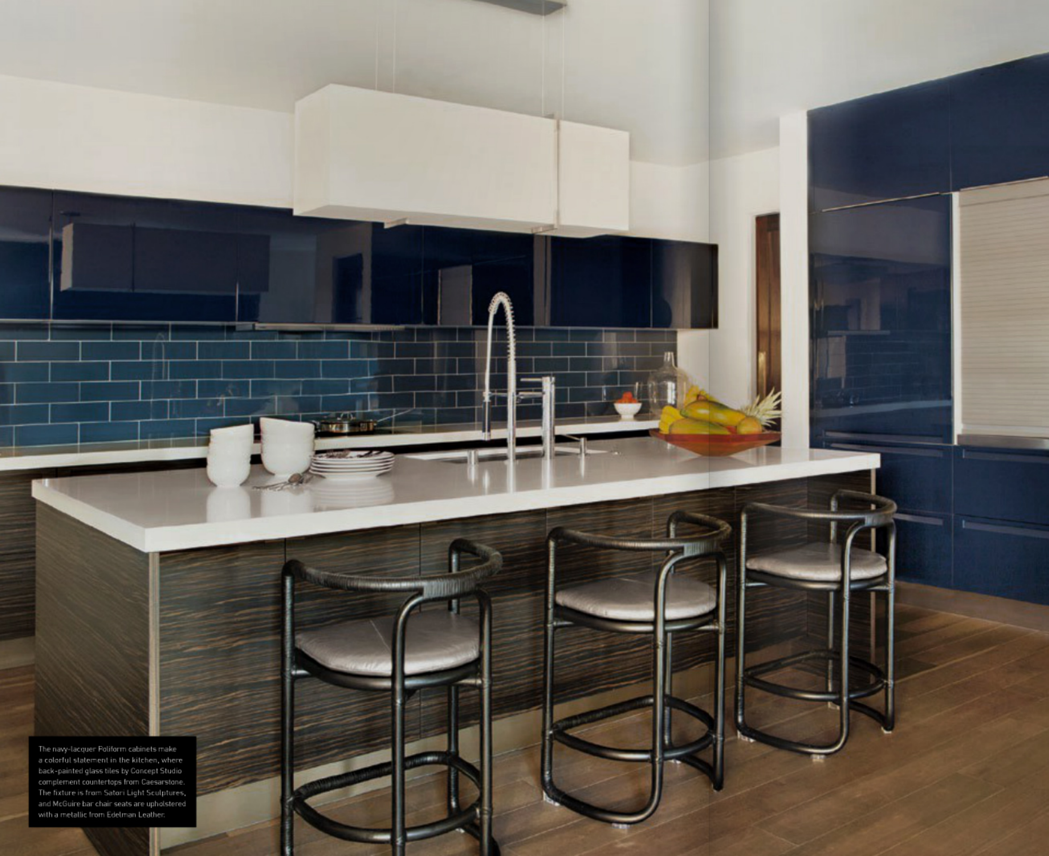
The navy-lacquer Poliform cabinets make a colorful statement in the kitchen, where back-painted glass tiles by Concept Studio complement countertops from Caesarstone. The fixture is from Satori Light Sculptures, and McGuire bar chair seats are upholstered with a metallic from Edelman Leather.