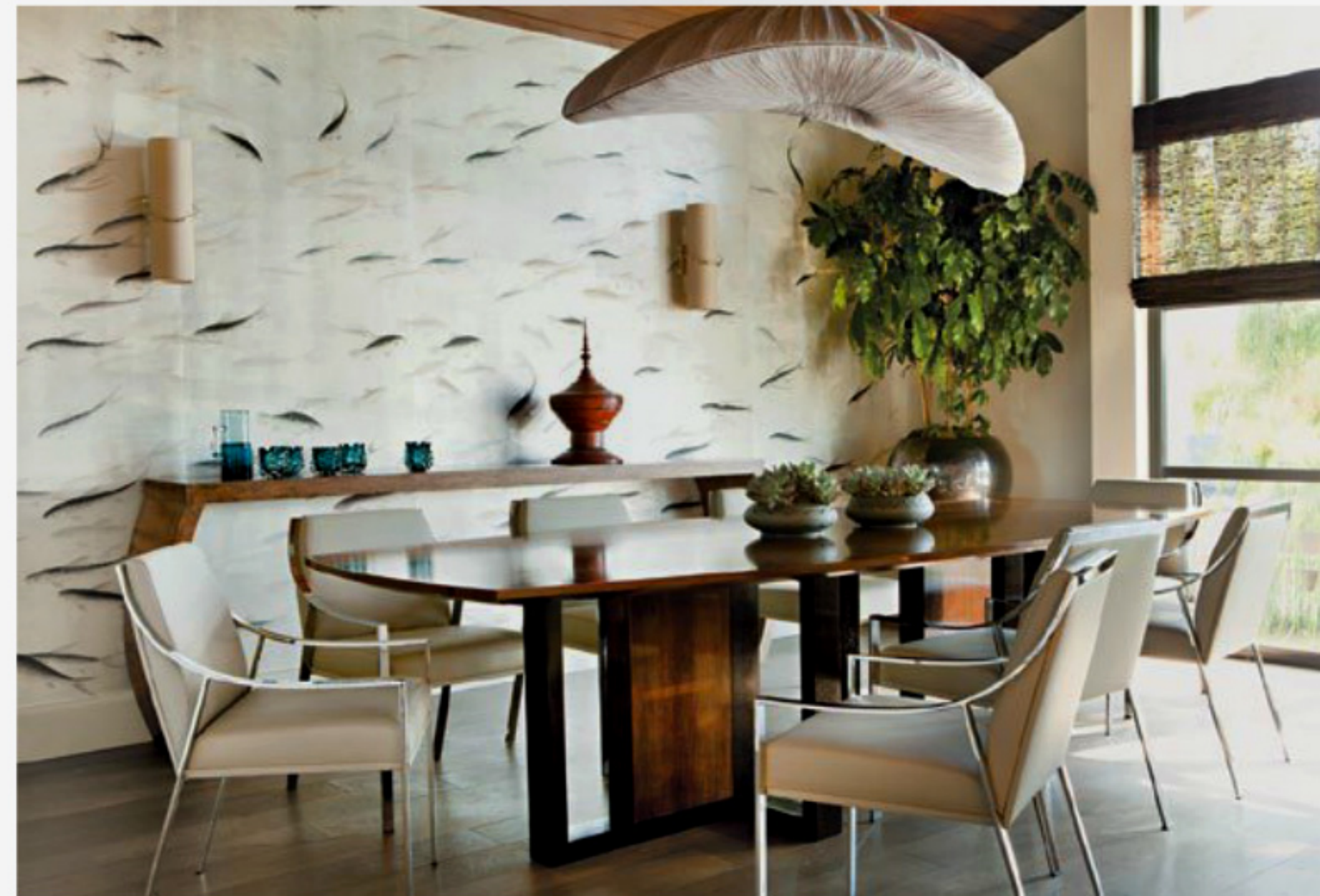
Hand-painted fish swim across a silk De Gournay wallcovering in the dining room, where a Liana S. pendant by Aqua Creations resembles a sea creature. The designers created the custom table and the Asian-inspired console. The Aileron chairs are by Holly Hunt.