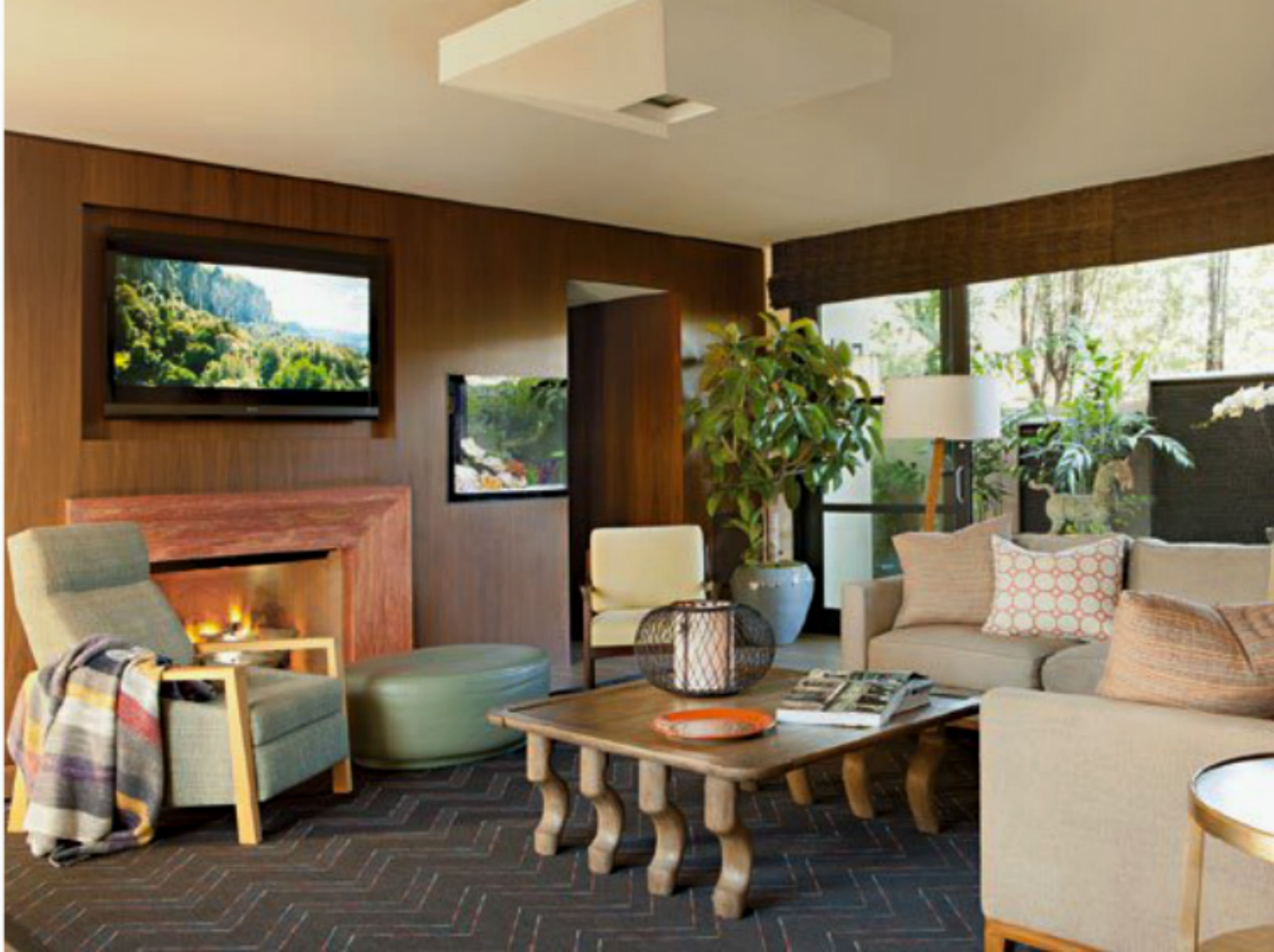
Above: The walnut-clad fireplace wall in the family room is inset with a saltwater fish tank. A custom linen-covered sectional faces a sculptural eight-leg coffee table, which the designers created with a practical weathered finish. Right: A Buddha statue overlooks a koi pond near the front entry.